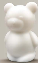
LT-12-115 ( Normal AA Battery Version) LT-12-115C (Charging version)

100% BPA free and recyclable material that protect your family and the earth, Patented switch triggering system provides the easy operation anytime and anywhere