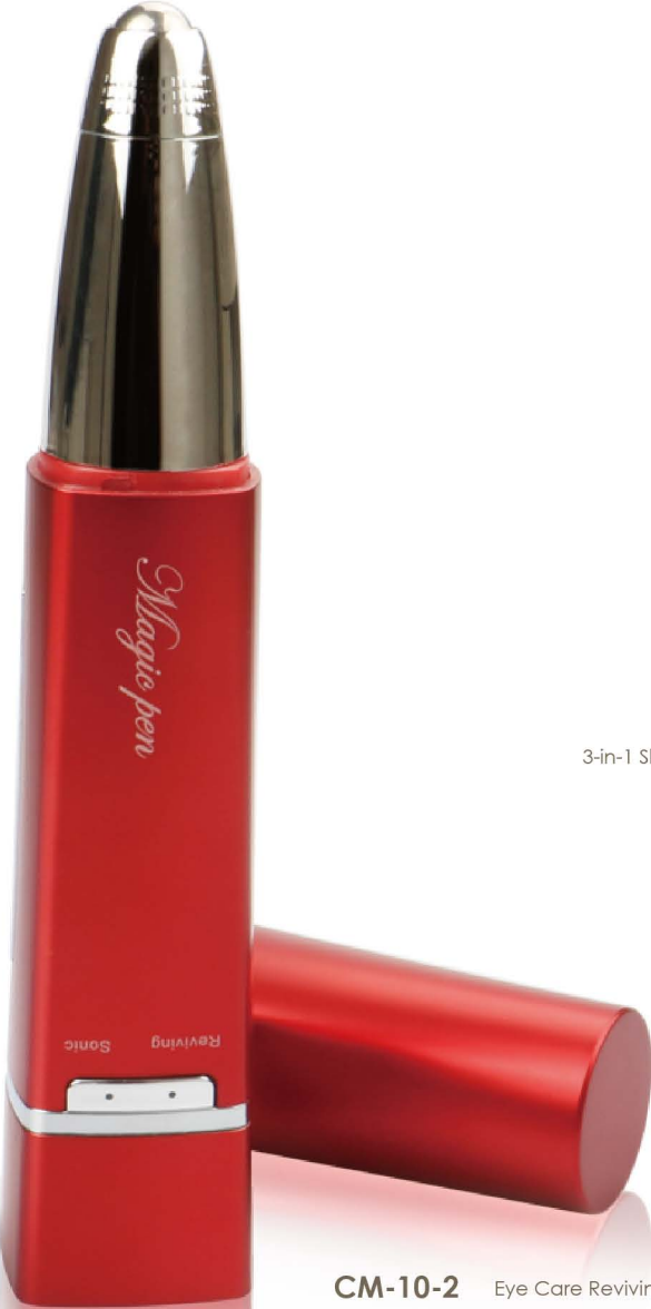
CM-10-2 Eye Care Reviving

Innovation tools for skin care, will solve all the problems of your skin from face to whole body .