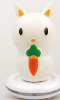
LT-12-001C~013C ( Rechargeable version)